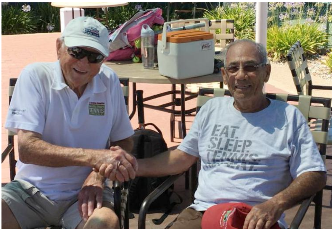
Tee-shirt: "EAT. SLEEP. TENNIS. REPEAT." Great advice from a Nonagenarian!

Registration for teams in the Adult 70 and over league has closed. There are 28 men's teams and 16 women's teams. USTA held three 70's Kickoff events prior to the closing. One of the events was held at Laguna Creek Tennis club in Elk Grove. The pictures are from that venue. Two of the players were in their 90's. See picture below.