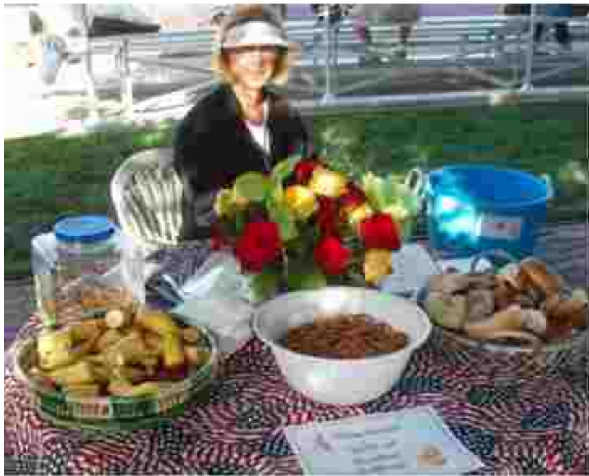
September Tournament in Sonoma