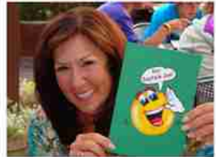
Clockwise: NVT 3.5 team party